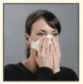
Place both hands completely over the respirator and exhale. If you feel leakage, there is not a proper seal.