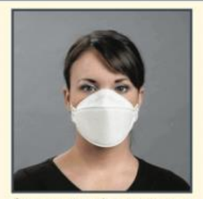
If you cannot achieve a proper seal due to air leakage, ask for help or try a different size or model.