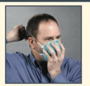
The top strap (on single or double strap respirators) goes over and rests at the top back of your head. The bottom strap is positioned around the neck and below the ears. Do not crisscross straps.