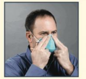
Place your fingertips from both hands at the top of the metal nose clip (if present). Slide fingertips down both sides of the metal strip to mold the nose area to the shape of your nose.