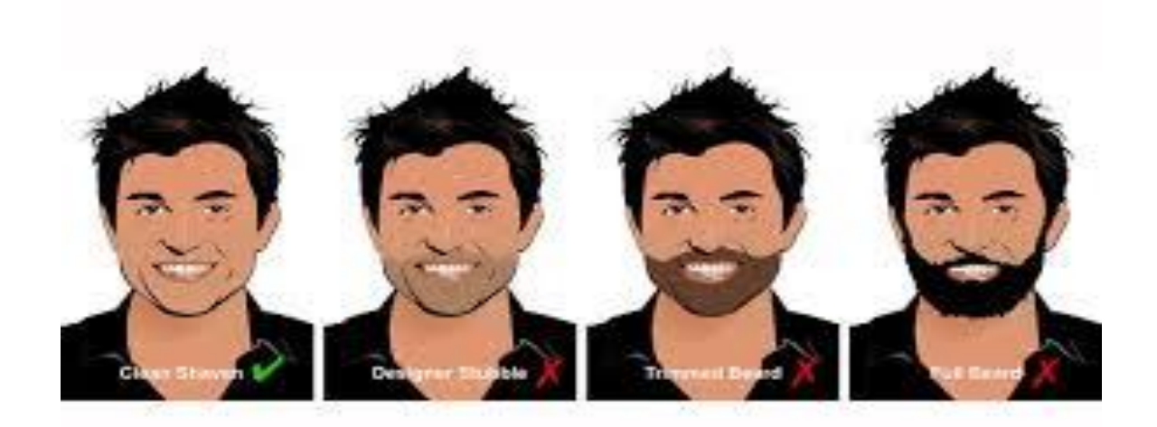
Figure 1. Amount of facial hair that will permit a proper seal

Users must shave the seal area of the face the day prior to using a respirator as depicted in Figure 2. Respirator users are advised to keep shaving materials on hand to ensure they can create a safe seal prior to using a respirator when needed.