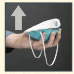
Position the respirator in your hands with the nose piece at your fingertips.