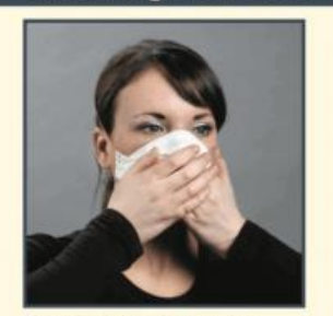
Place both hands over the respirator, take a quick breath in to check whether the respirator seals tightly to the face.