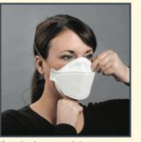
If air leaks around the nose, readjust the nosepiece as described. If air leaks at the mask edges, re-adjust the straps along the sides of your head until a proper seal is achieved.