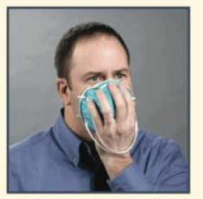
Cup the respirator in your hand allowing the headbands to hang below your hand. Hold the respirator under your chin with the nosepiece up.